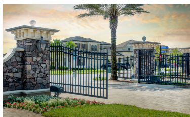
LARGE SWING GATES