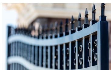
LARGE SECURITY GATES